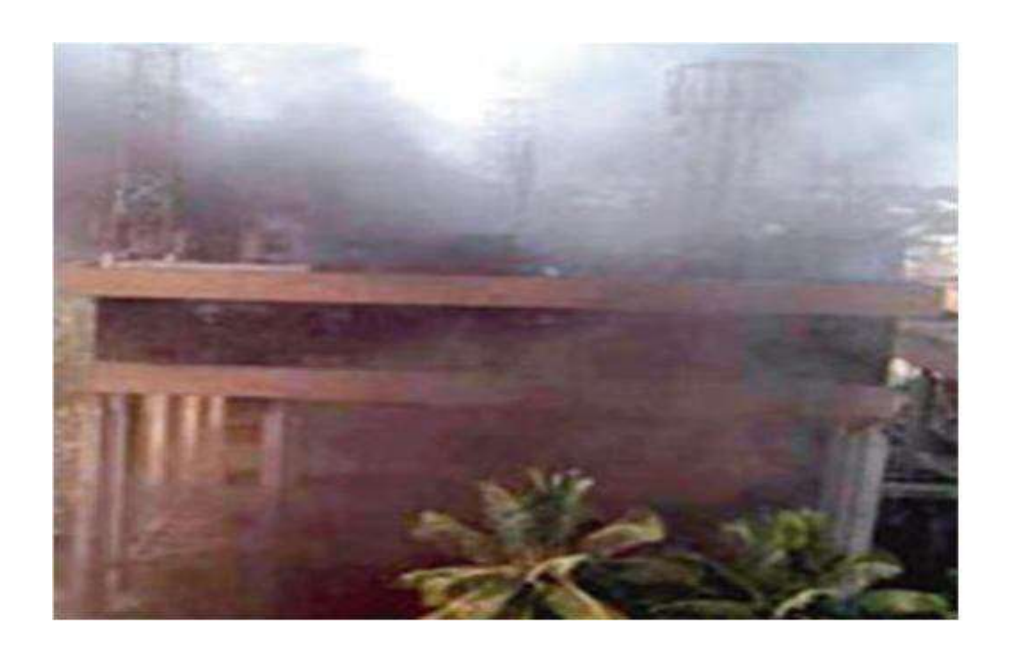
Photo shows the engulfing smoke and toxic substances from basement to top floor.

Failure aspects: The firefighting appurtenances are not working, blocking of escape routes and evacuation procedure.